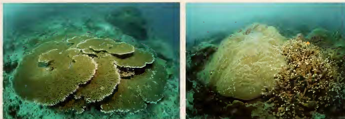
Figure 17. Healthy reef communities at 10 m water depth at Pulau Rondo, October 29, 2005.

On the east side of Pulau Rondo the shallow survey was dominated by rock (50% cover) with rubble representing 30% of the substrate and live coral cover only 17%. The deep survey was dominated by rubble (70% cover), with little live coral cover (18%). Tsunami damage was observed in this area; specifically overturned dead Acropora spp. tables and a large tree trunk (over 6 m in length) had been deposited on the reef between 15 m and 18 m water depth (Fig. 18).